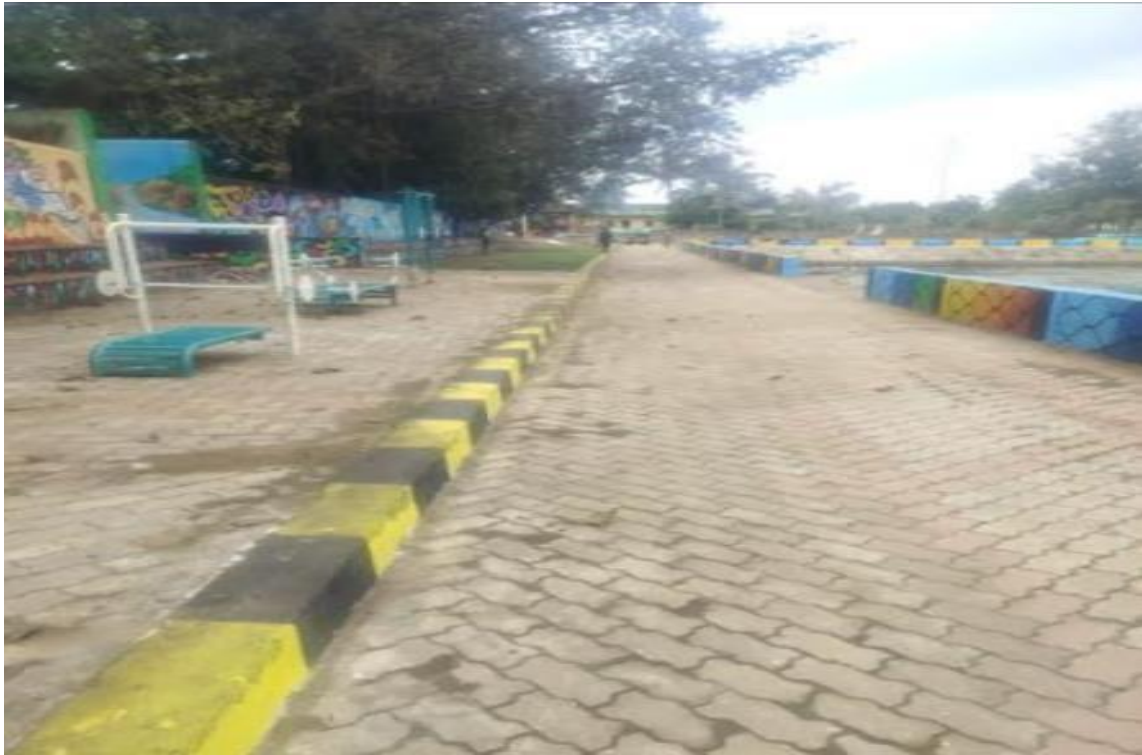
Bermunda Bus Terminus